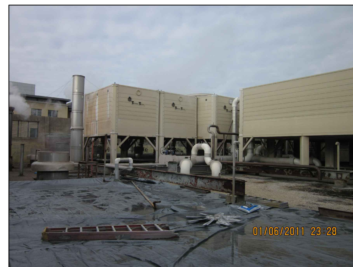
WEST ENERGY PLANT-IMAGE 6