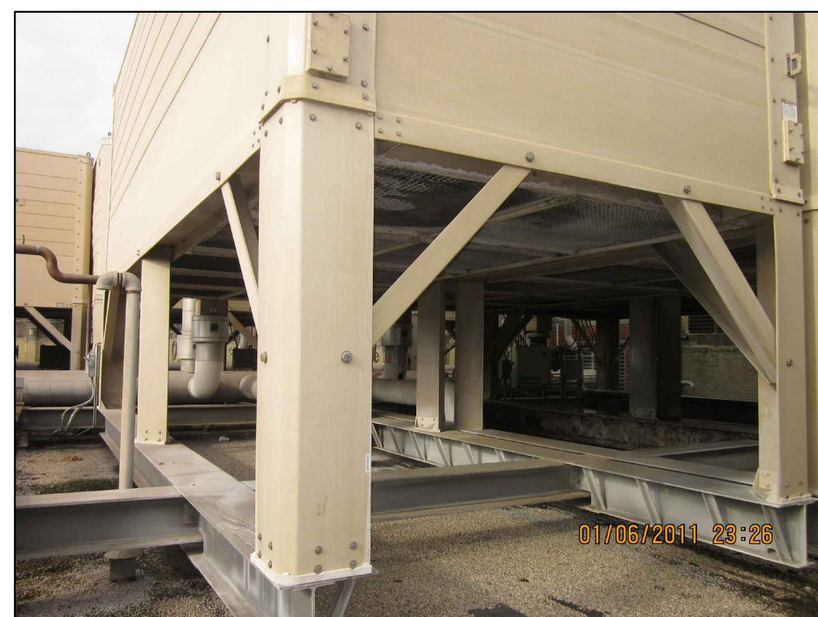
WEST ENERGY PLANT-IMAGE 3