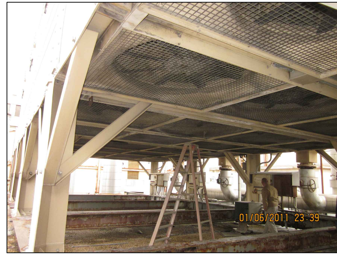
EAST ENERGY PLANT-IMAGE 3