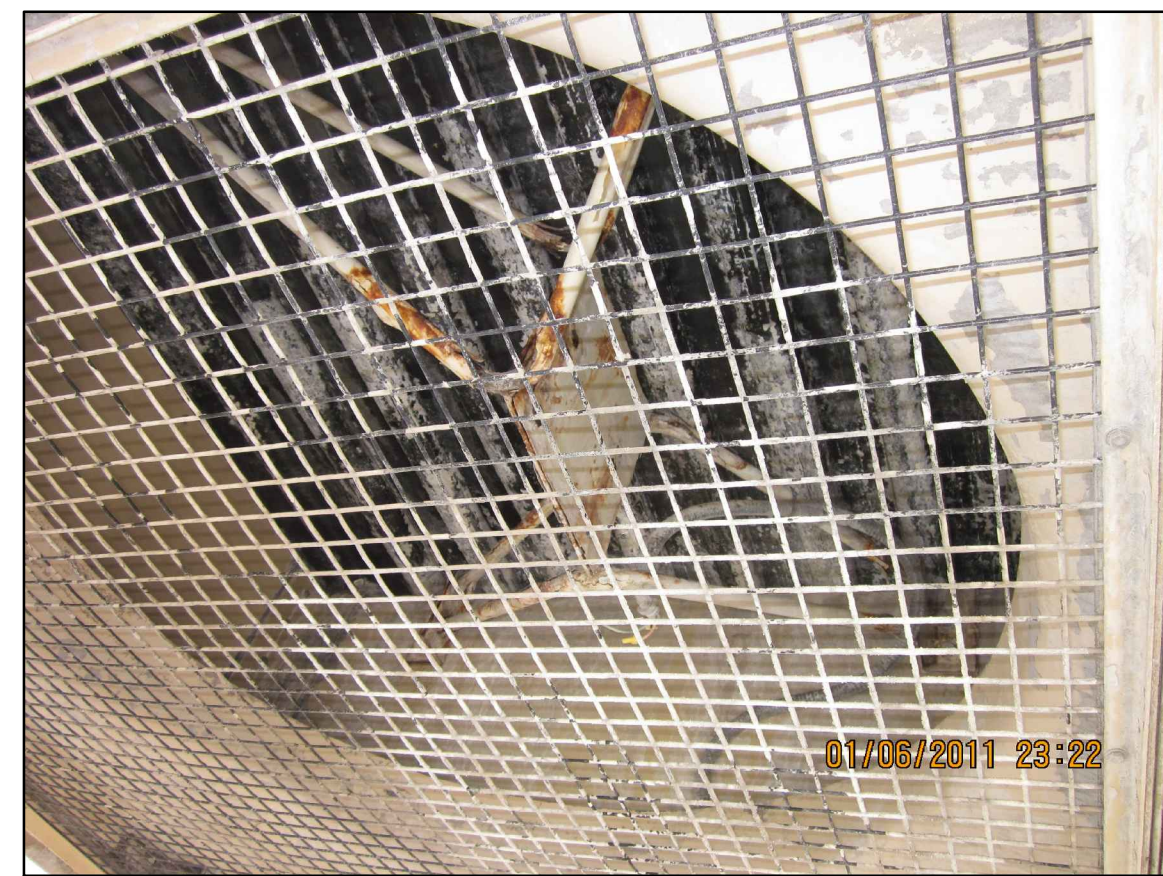
WEST ENERGY PLANT-IMAGE 1