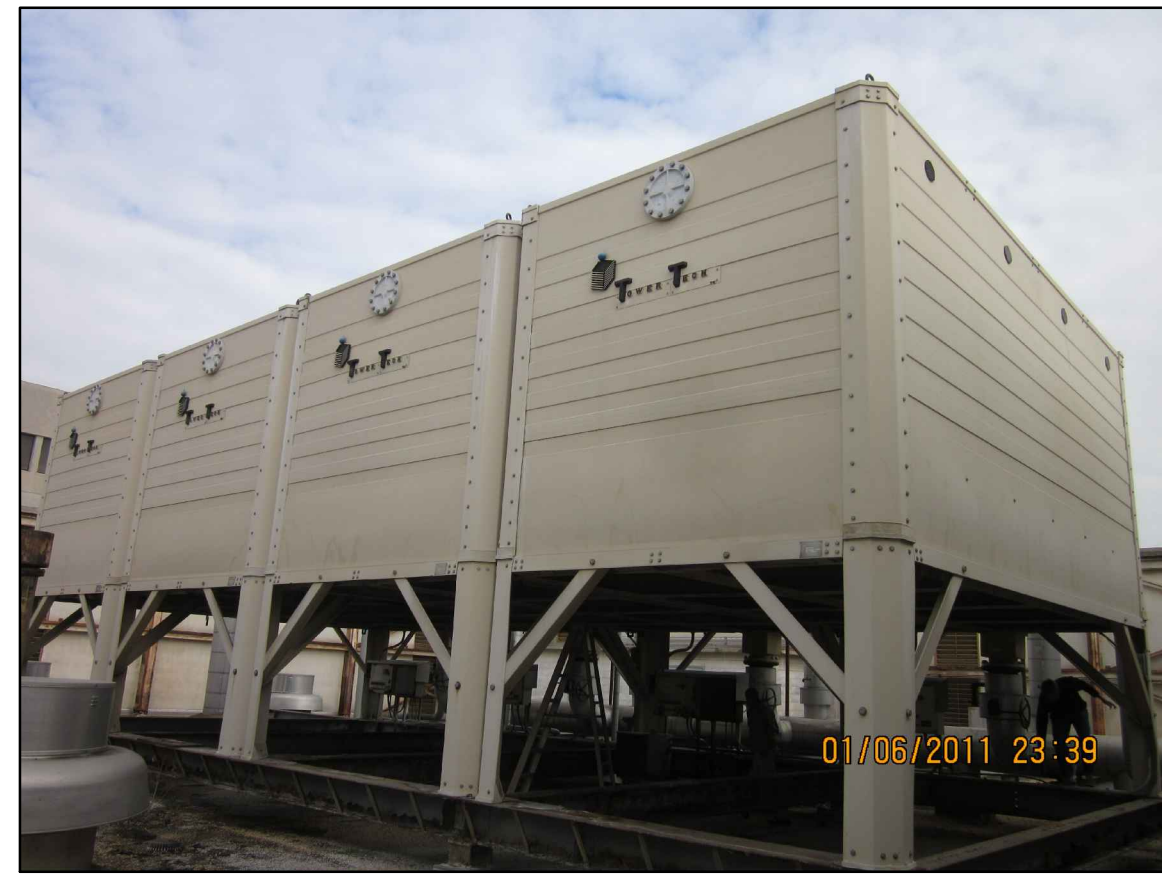
EAST ENERGY PLANT-IMAGE 2