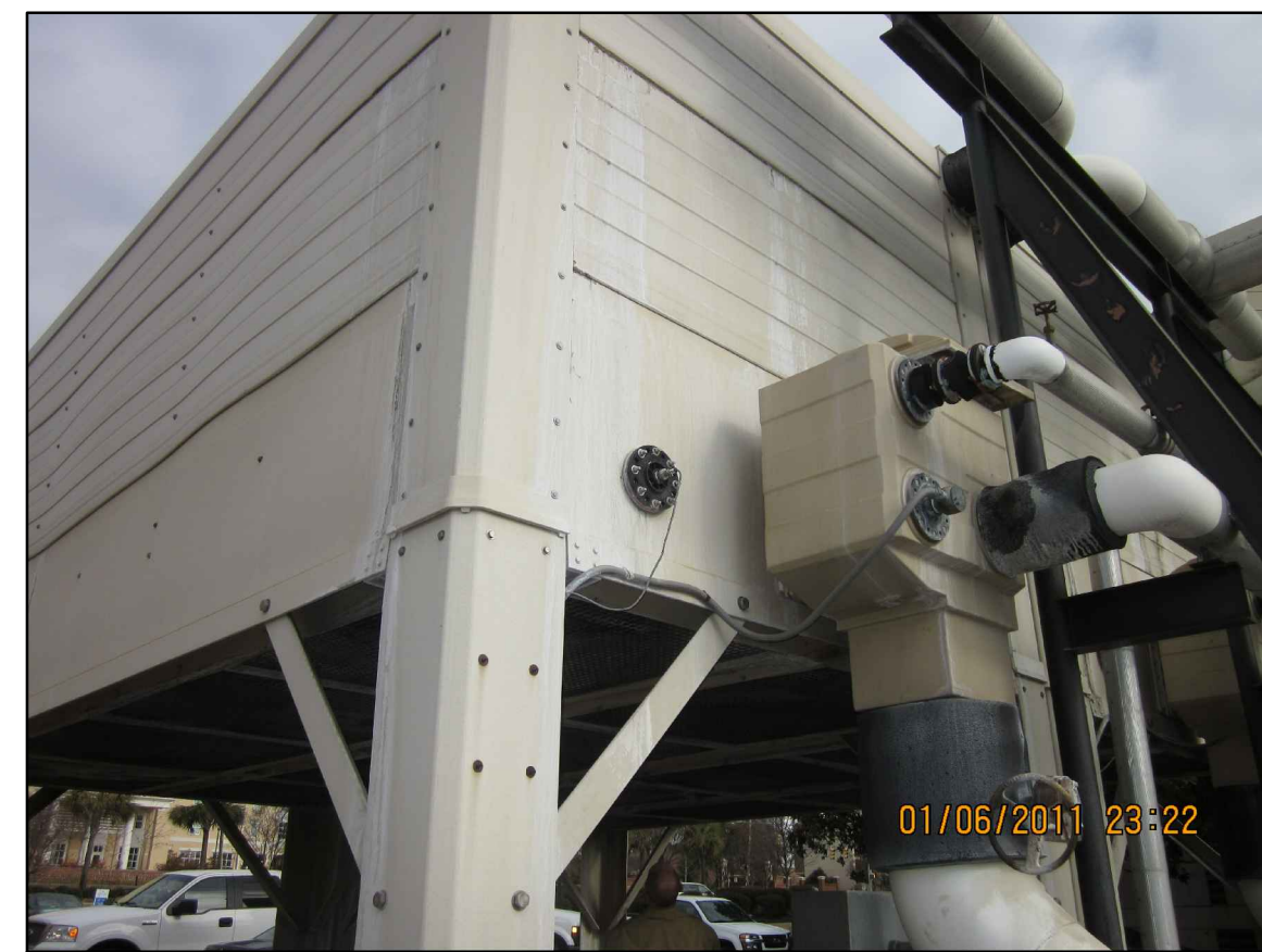
WEST ENERGY PLANT-IMAGE 2