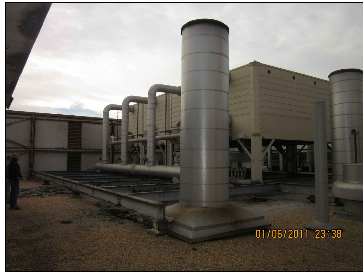
EAST ENERGY PLANT-IMAGE 1