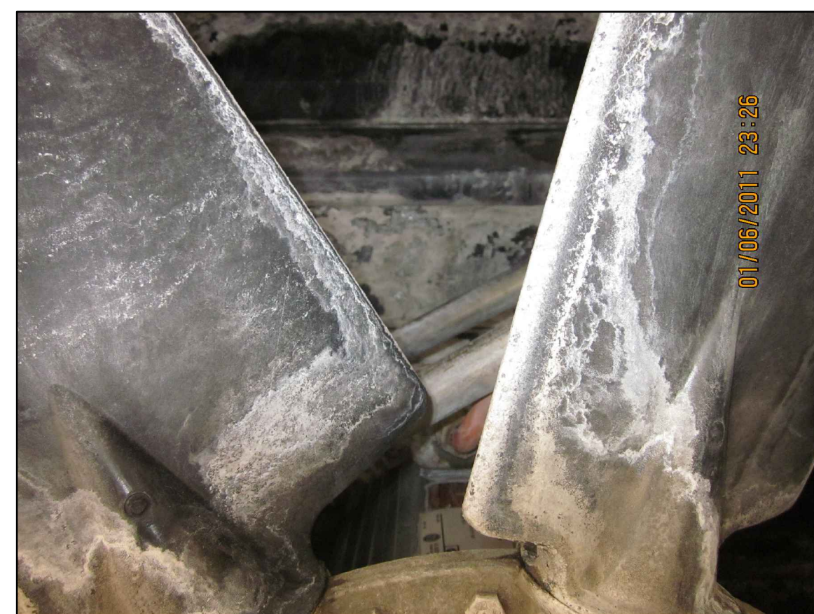
WEST ENERGY PLANT-IMAGE 4