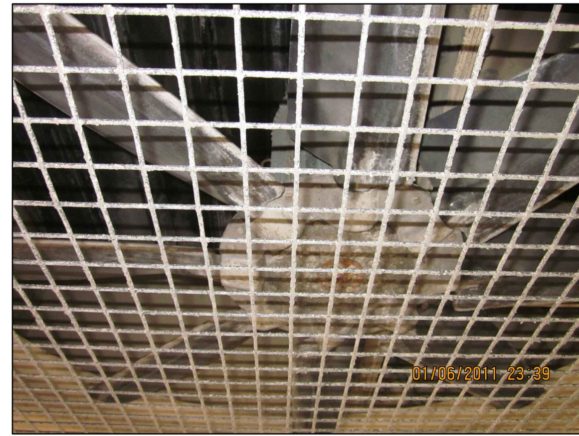
EAST ENERGY PLANT-IMAGE 4