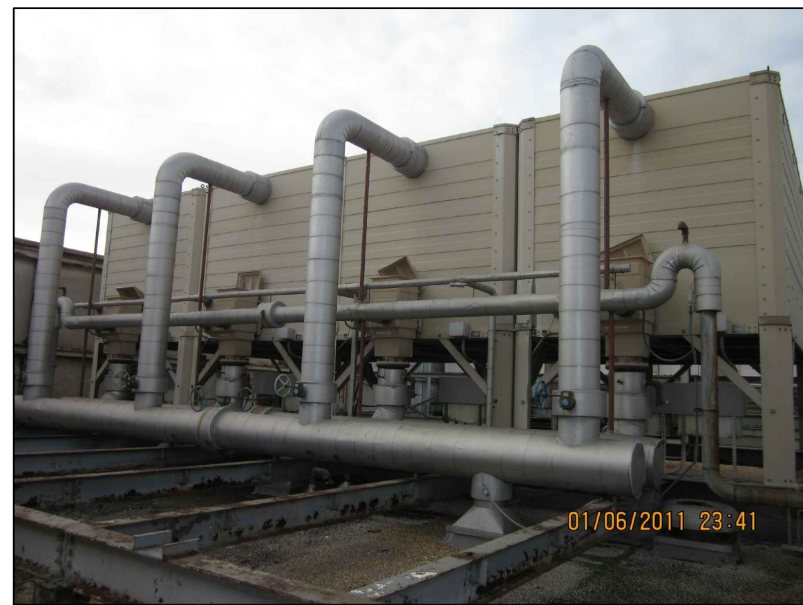
EAST ENERGY PLANT-IMAGE 6