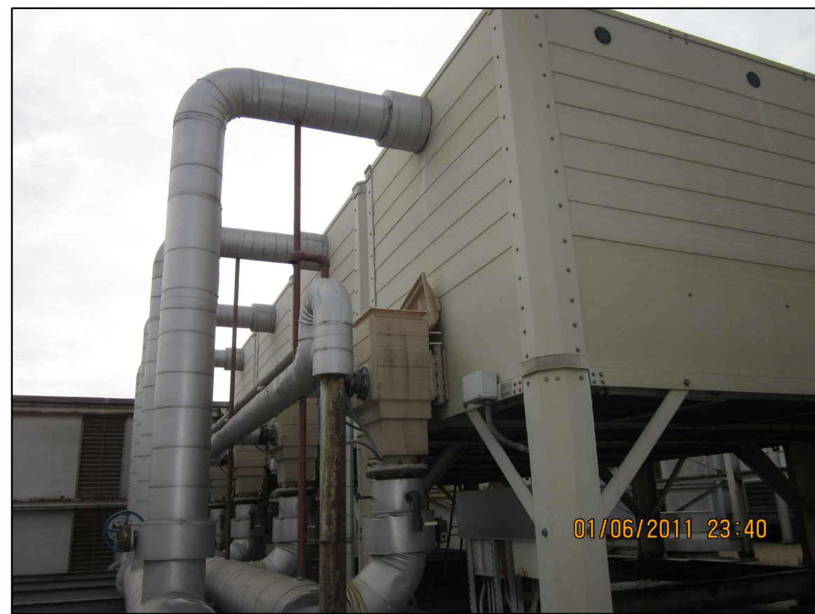
EAST ENERGY PLANT-IMAGE 5